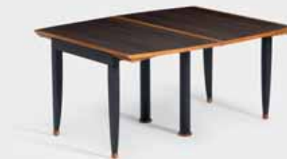
Table with structure and legs in massive wenge wood, top in multilayered wood with wenge veneer, edges in massive cherry wood. Sliding top in multilayered wood with rails in massive wood, central legs with adjustable height. Indoor use only. W.151/282 D.120 H.73.5.