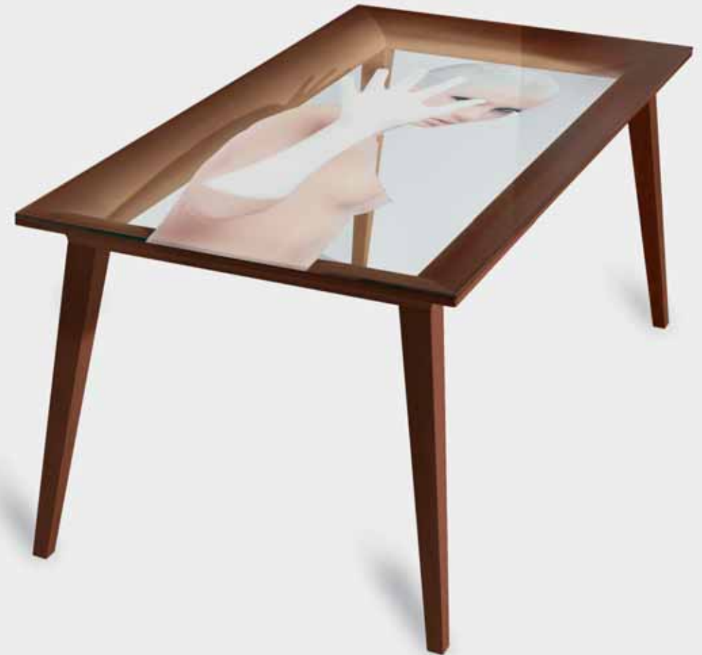
Table with structure in solid natural mahogany and rectangular top with printed image on tempered extra-clear glass. For indoor use only. W.160 D.80 - W.180/210 D.90 H.72.